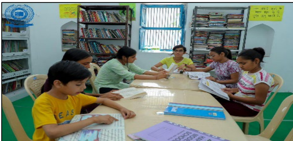
Inauguration of Library at Sultanpur in collaboration with Gram Panchyat