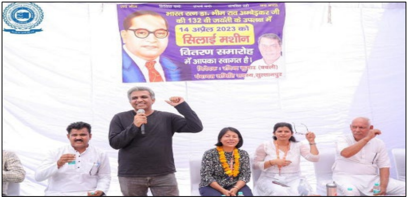
Sewing Machine Distribution function