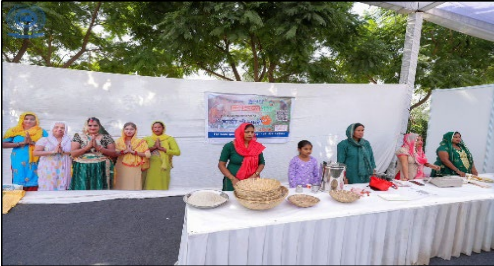
Haali Ki Thaali