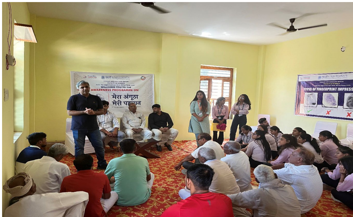
Awareness session on Mera Angootha Meri Pehchaan